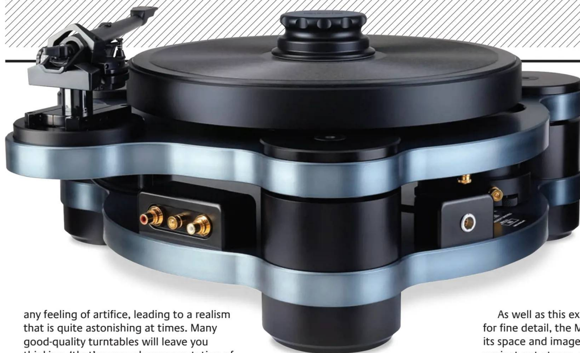
LEFT: The Series Vi's very flexible arm cabling connects into an RCA/ground post terminal block [left]. Other chassis earthing points are offered adjacent to the LEMO PSU socket [right]

any feeling of artifice, leading to a realism that is quite astonishing at times. Many good-quality turntables will leave you thinking, 'that's a superb representation of a double bass in front of me'. The Model 35 is more likely to leave you thinking, 'that's a double bass in front of me'.