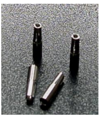
4 point contact construction