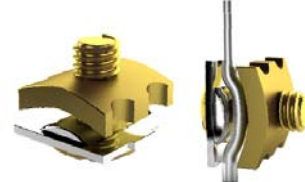
Furutech Patent Pending Clamp

Contact Area Calculated Increase: 17.142%