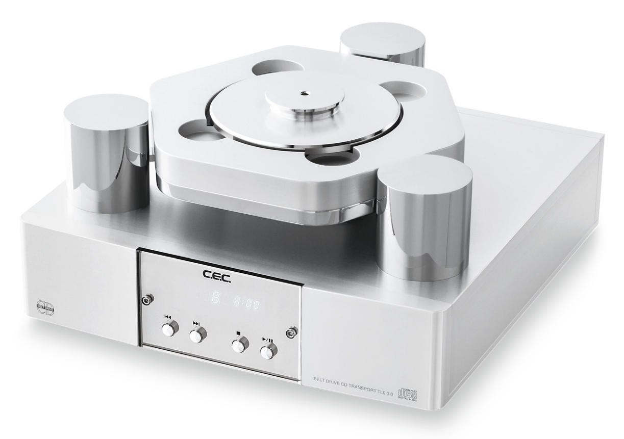
CEC CD Transport TL 0 3.0 and CEC D/A converter DA 0 3.0