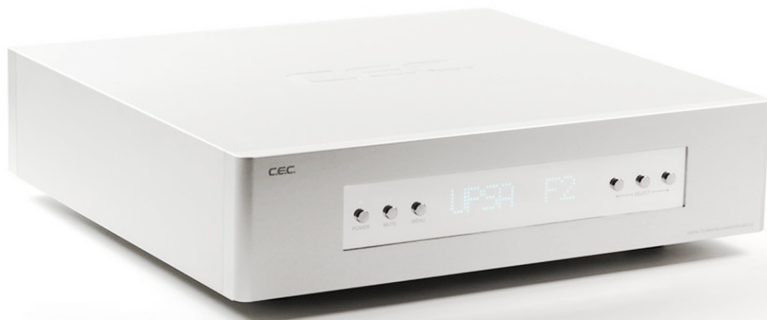
CEC DA 0 3.0 - Universal DSP controlled discrete resistor ladder 32bit/384kHz Audio DAC